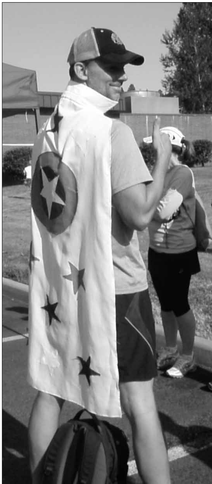
4TH OF JULY 4 MILER

Rating: 5 out of 5 (for those who don't like running loops, 4.5). If only we had a trail like this in Portland!